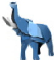
Figure : code/htdocs/favicon.ico