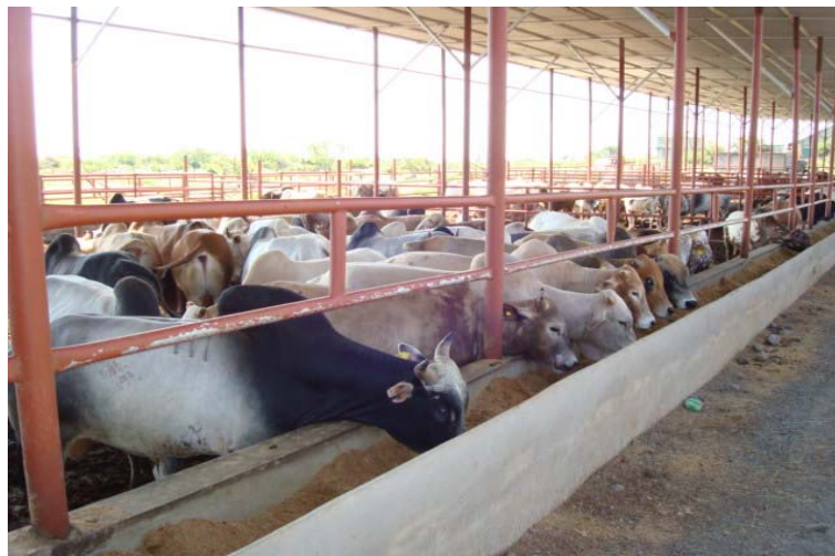
Kenyan bulls in a feedlot in Mauritius, mainly fed on baggas

increasingly stringent SPS requirements for live animal exports go way beyond the prevailing standards in Ethiopia and Kenya to access lucrative markets. Third, less stringent meat export requirements can be met easily with the added benefits of value adding and employment creation. There is also a remote possibility of entering into lucrative export markets as and when the 'commodity-based certification system' is ratified by the OIE sometime in the future. The bottom line is that although the export of live animals can be continued as the situation permits, the strategic focus should be on expanding meat exports, notwithstanding the prevailing logistical difficulties and SPS standards, for better economic and financial returns.