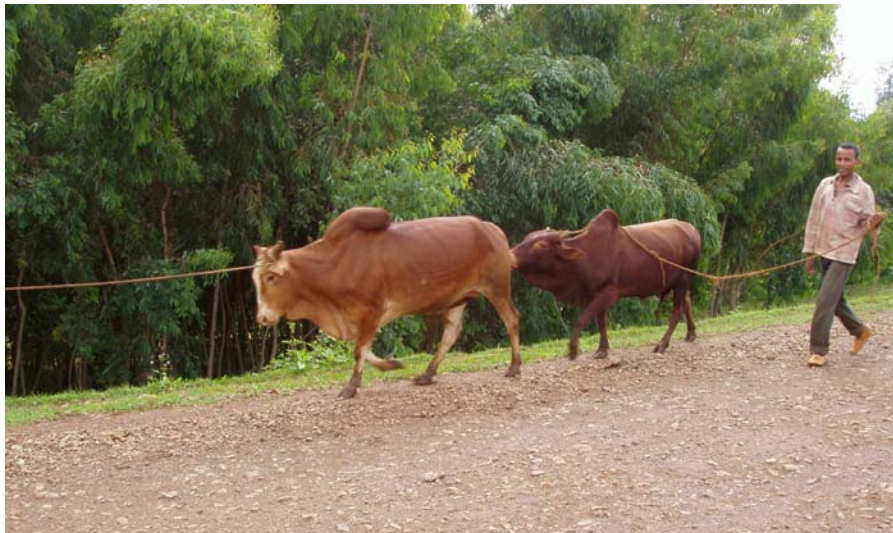
Farmer taking stall fed bulls to market in Western Ethiopia

purchased from lowland areas were distributed on loan to highland farmers for finishing. The loan and the interest were repaid to the project upon selling the finished animals 35 . Unfortunately, the programme was phased out with the project despite the success of the scheme.