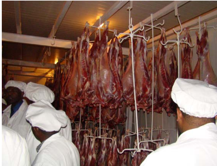
Carcasses for export from one of the private abattoirs in Ethiopia