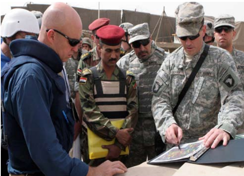
UNHCR staff are briefed by US troops near Hurriyah on the situation of displaced persons, September 2008.

The war in Iraq has gone on longer than World War I and, while violence diminished in the second half of 2007, nothing has been resolved. The differences between Shia and Sunni, the disputes within the respective communities, and the antagonism against the US occupation are all as great as ever.